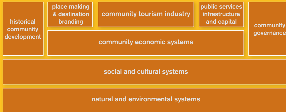
Figure 1 Eight Community Tourism Resources

Figure 1 depicts our understanding of how eight community resources relate to one another. Each resource was studied by its own research team represented by one box in the figure. Starting at the bottom is a box representing Natural and Environmental Systems which we consider the most basic community resource. It supports social and cultural systems and the economic system. Historical community development defines the community as a “place” which is an important condition for image creation and destination branding. Social and Cultural systems work with community governance to provide public services, infrastructure and along with economic development creates capital. The tourism industry is supported in many ways by all of the other community resources.