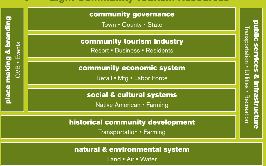
Figure 1 Eight Community Tourism Resources

This report describes the results of the regional resources and tourism potential for Marana and Oro Valley. The research was conducted in the spring of 2011 by 42 ASU students in TDM 402 (Tourism Research) under the supervision of Dr. Timothy Tyrrell. It describes the resources and opportunities for six geographic districts of the region leading toward the development of an integrated tourism development plan. Each of the six districts was analyzed in terms of eight separate resource categories as shown in the figure.